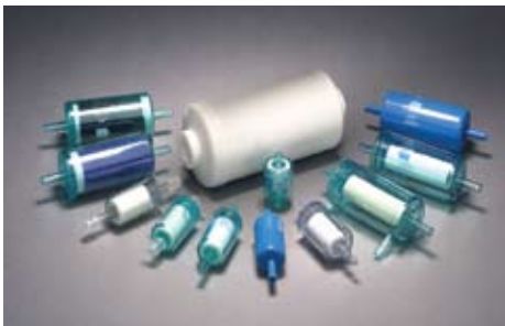
Balston Disposable Filter Units

Balston brand disposable filter units (DFU) consist of a microfibre filter cartridge permanently bonded into a sealed plastic holder with 125 psig pressure ratings, temperatures to 275°F, and available in low and high flow models. The economical DFU offers all of the advantages of microfibre filter cartridges for high efficiency liquid and gas filtration, combined with the economics and convenience of complete disposability.