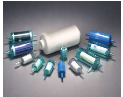
Balston Disposable Filter Units