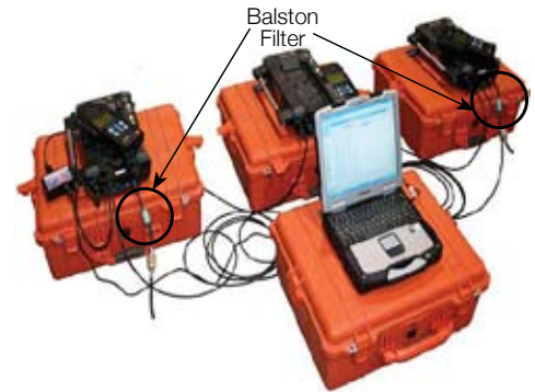
Combustion Gas Analyzers

Recognized as the industry leader in sample filtration and conditioning, Parker Balston flue gas filters are found in the majority of all instruments and analyzers as a supplied component.