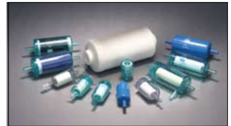
Balston Disposable Filter Units

Instrumentation used to perform this analysis are adversely effected by condensed contaminates, acidic and sulfuric gases and solid contaminates. These contaminates can skew the analysis but more importantly ruin the internals of the instrument to the point where a complete rebuild is required. Efficient removal of undesirable contaminates from a sample stream will ensure accurate analysis and trouble-free operation of the instrumentation.