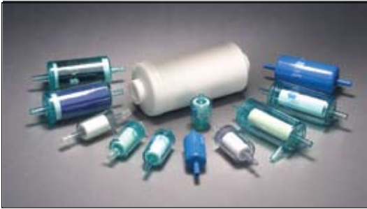
Balston Disposable Filter Units

Balston brand disposable filter units (DFU) consist of a microfibre filter cartridge permanently bonded into a sealed plastic holder with 125 psig pressure ratings, temperatures to 275°F, and available in low and high flow models. The economical DFU offers all of the advantages of microfibre filter cartridges for high efficiency liquid and gas filtration, combined with the economics and convenience of complete disposability.