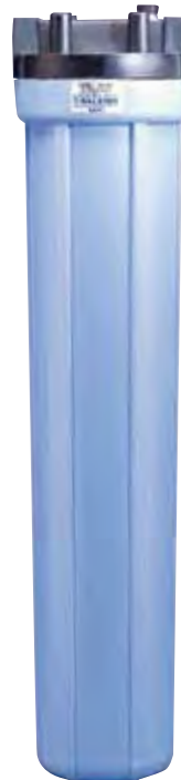
Models 53/18, 53/50, and 53/95 (shown)