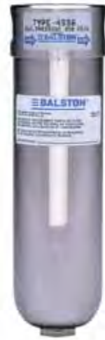
Models 33S6 and 45S6

All-stainless steel with 1/2" NPT inlet and outlet ports. Both filters are also available with clear Pyrex® glass bowl (100 psig rating) with breakage-protection external plastic shield.