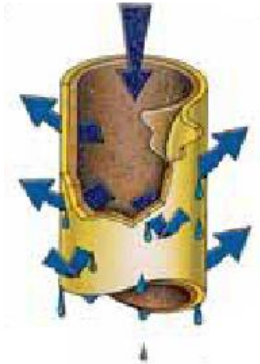
Figure 2 Permeation Membrane – Used to remove water vapor from air. The membrane bundle contains a large number of membranes to provide enhanced

Figure 1 Coalescing Filter – Used to remove oil and water droplets, particulate matter from compressed air. The liquids drip to the bottom of the filter housing and automatically emptied by a drain assembly.