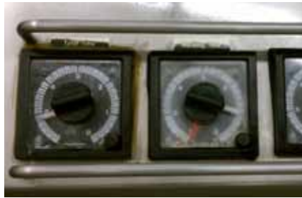
After Cabinet Dryer