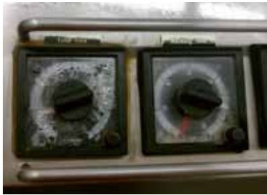
Before Cabinet Dryer