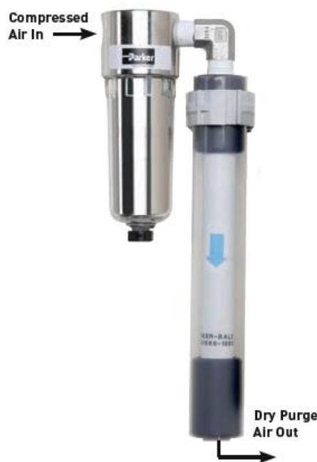
Figure 3: Cabinet Dryer Assembly

The coalescing filter is housed in an assembly to provide ease of operation and maintenance.